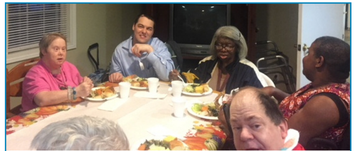
Friendsgiving event at Palermo House

On November 18th, everyone enjoyed an evening of fun at their "Friendsgiving" dinner, hosted by Palermo House. This winter, they attended the Nutcracker Ballet and a Charlie Brown Christmas at the Palace Theatre, and, of course, the much anticipated annual ARI holiday parties.