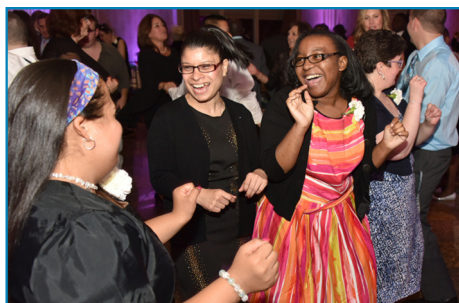
Members of the ARI Self-Advocacy Committee dance the night away.