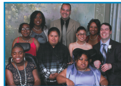
The ARI Self-Advocacy Group, most graduates of the transition program, at their formal event.